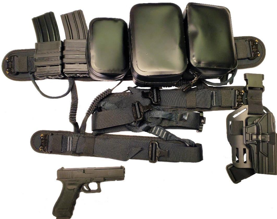
Image 2 V-2-SR Swim rig with a full MI-Ops fighting order and waterproof pouches